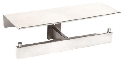
AI2006C Bright finish