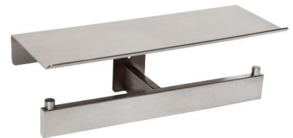
AI2006CS Satin finish