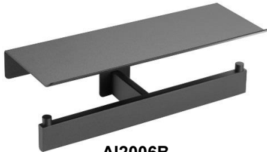
AI2006B Black finish